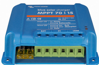
Solar charge controller MPPT 70/15