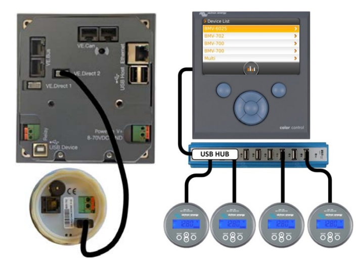
A maximum of four BMVs can be connected directly to the Color Control. Even more BMVs can be connected to a USB Hub for central monitoring.

The powerful Linux computer, hidden behind the colour display and buttons, collects data from all Victron equipment and shows it on the display. Besides communicating with Victron equipment, the Color Control communicates through CAN bus (NMEA2000), Ethernet and USB. Data can be stored and analysed on the VRM Portal.