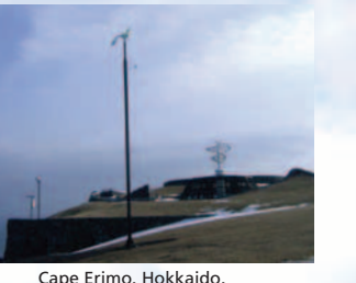
One of the windiest areas in Japan